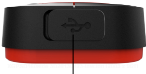
USB port for charging

To turn off, triple-click the power button again. The LOG indicator will flash to confirm your selection.